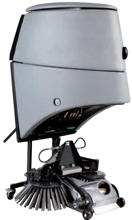
Minimal storage space needed

Fitting the suction sweeper is easy and quick. The attachment is backed in under the hopper, then driven forwards, so the front brushes attach to the A-frame. All the operator then has to do is lock two locking levers, one on the A-frame and one on the hopper. The hydraulics, power, water supply and vacuum hose connect automatically. It is impossible to make a mistake; the two locking levers will not lock if something is amiss.