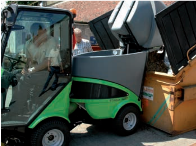
Hydraulic tipping, directly into container